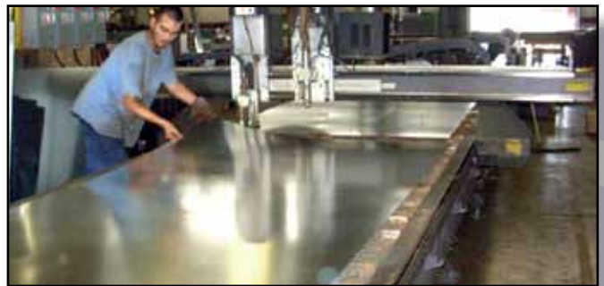
A pendulum processing feature lets the MultiCam Plasma cut one sheet while the operator loads another.