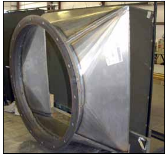
M&M manufactures heavy-duty fittings.