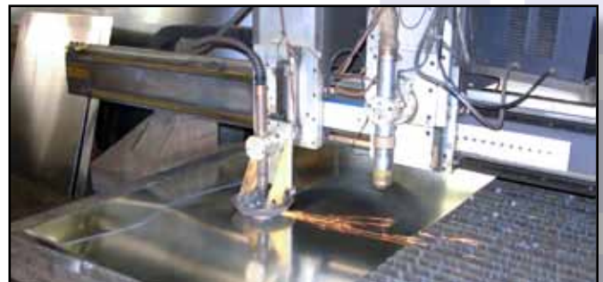
The MultiCam Plasma produces a clean, smooth, dross-free cut.