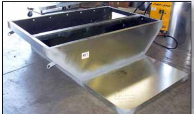
M&M assembles sheet metal parts to make commercial and industrial HVAC roof curb adaptors.

1025 West Royal Lane, DFW Airport, TX 75261 Phone: 972-929-4070 • Fax: 972-929-4071 www.multicam.com • sales@multicam.com